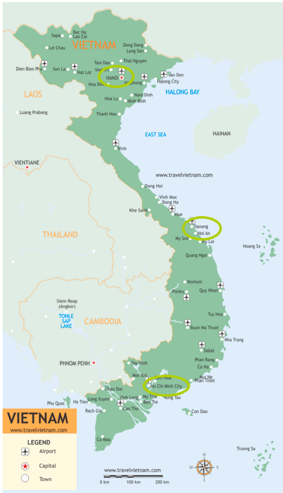
Fig. 1. Research locations – Ho Chi Minh City, Da Nang, Hoi An and Ha Noi.