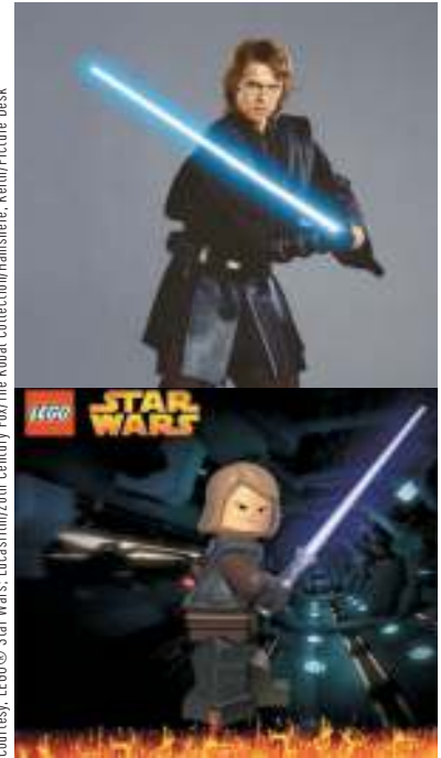
Courtesy, LEGO® Star Wars; Lucasfilm/20th Century Fox/The Kubal Collection/Hamshire, Keith/Picture Desk