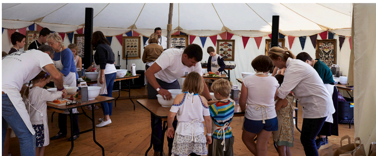
Fig. 2. A visual represents the intergenerational interaction of the Abergavenny Food Festival website. Source: https://www.abergavennyfoodfestival.com/cook-stars-kids-cookery-school/ , copyright of the Abergavenny Food Festival, last accessed April 15, 2024.