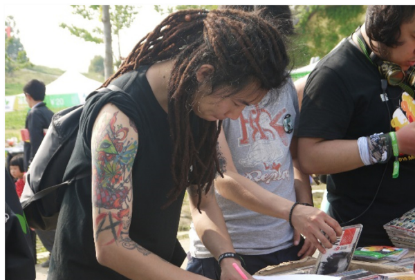
Photo 1. Dreadlocks and tattoos rarely openly displayed in Chinese society; by author.