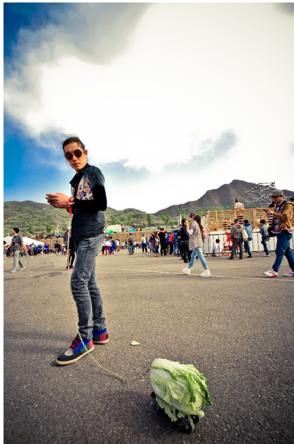
Photo 3. 'Walking the cabbage' to signify social isolation in everyday life; by Wuhujun.

"[Midi] embodies utopia. It's not utilitarian, it's different from the outside world. It seems independently exist here[...]In Midi, every stranger is 'family', when we are here, everybody is brothers, and are trustworthy"