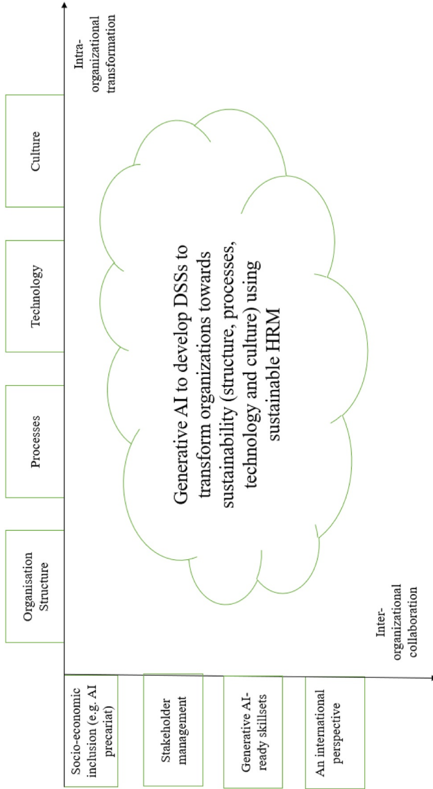
FIGURE 6 Research scope of generative AI to embed sustainability within organizations through sustainable HRM. [Colour figure can be viewed at wileyonlinelibrary.com ]