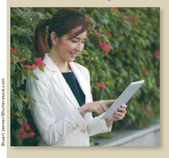
Chapter 8 Positive Messages 252

with Humor 253 Neutral and Positive Messages: The Writing Process 253 Routine Request, Response, and Instruction Messages 257 Checklist: Writing Direct Requests and Responses 260 Direct Claims and Complaints 264 Adjustment Messages 268 Checklist: Direct Claim, Complaint, and Adjustment Messages 273 Goodwill Messages 274 Checklist: Goodwill Messages 277