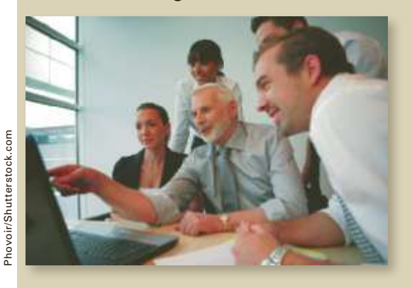
Chapter 10 Persuasive and Sales Messages 338

Persuading Effectively and Ethically in the Contemporary Workplace 340 Blending Four Major Elements in Successful Persuasive Messages 346 Writing Persuasive Requests, Making Claims, and Delivering Complaints 350 Checklist: Using the AIDA Strategy to Request Actions, Make Claims, and Deliver Complaints 353 Writing Persuasive Messages in Digital Age Organizations 353 Creating Effective Sales Messages in Print and